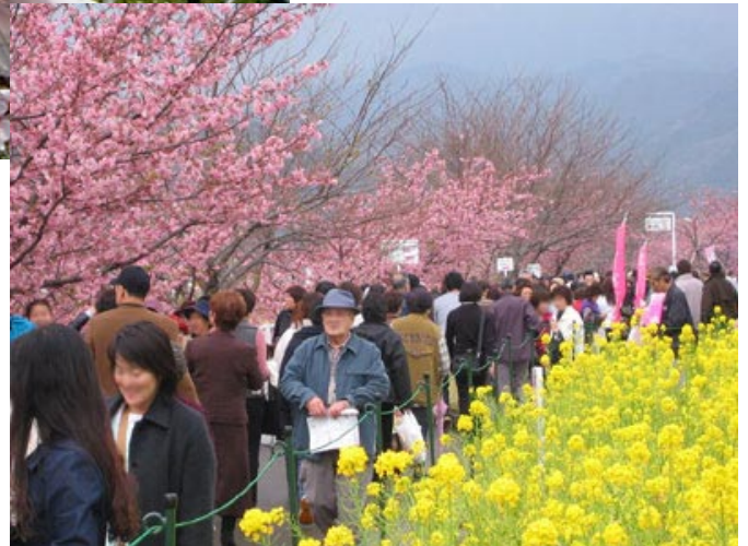
People attending the festival of Hanami